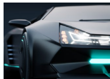
LED Head Lamp